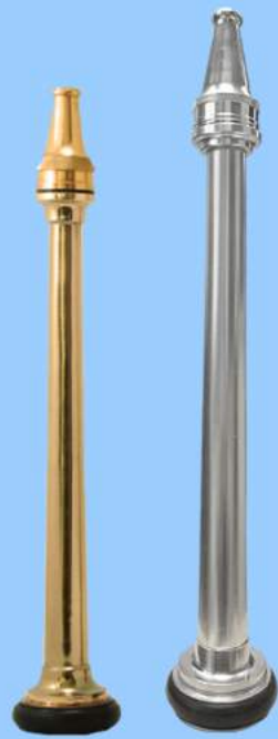
Hose Nozzle Size : 1.5" & 2.5" Material : Brass Alloy & Alumunium