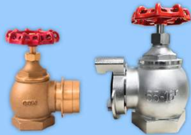
Hydrant Valve Model : Machino & VDH Size : 1.5" & 2.5" Material : Brass & Chrome Pressure Test : 10 bar & 16 bar